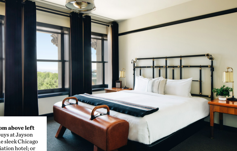
Clockwise from above left Find unique buys at Jayson Home; stay at the sleek Chicago Athletic Association hotel; or at hip, triangular The Robey; and visit the Ryerson & Burnham Libraries at the Art Institute of Chicago