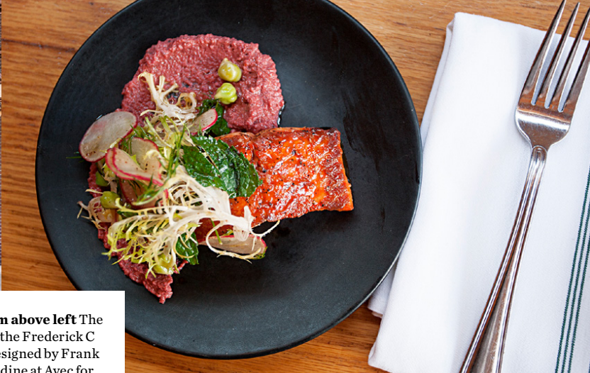
Clockwise from above left The living room in the Frederick C Robie House designed by Frank Lloyd Wright; dine at Avec for a fusion of Med meets Midwest; see vibrant street art in the Pilsen district; and Anish Kapoor's Cloud Gate sculpture