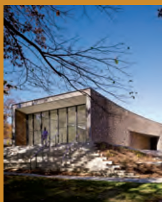
2014 - The Arcus Center for Social Justice Leadership at Kalamazoo College in Michigan has carbon-negative walls