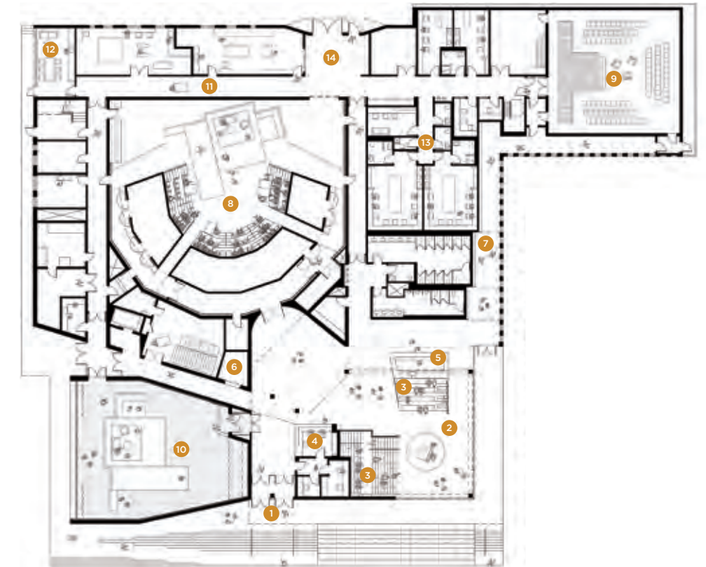
3 (previous spread) – The Gallery and entrance have a pastoral setting but actually face the townscape on this side