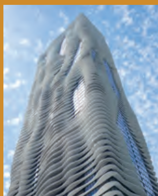
2010 - Chicago's sublimely terraced Aqua Tower is the first bird-friendly skyscraper. Studio Gang's Vista Tower will soon rise nearby