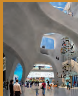
The shape of things to come - The Gilder Center at New York's Museum of Natural History, like the Aqua Tower, has forms inspired by geology