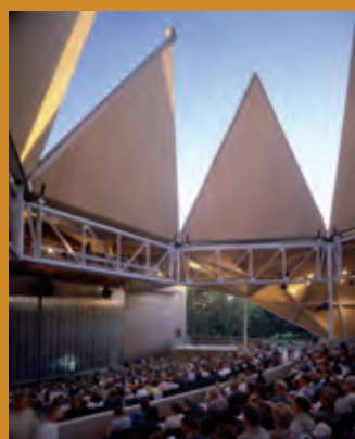
2003 - The Bengt Sjostrom Theatre in Rockford, Illinois has a roof that opens like an origami piece