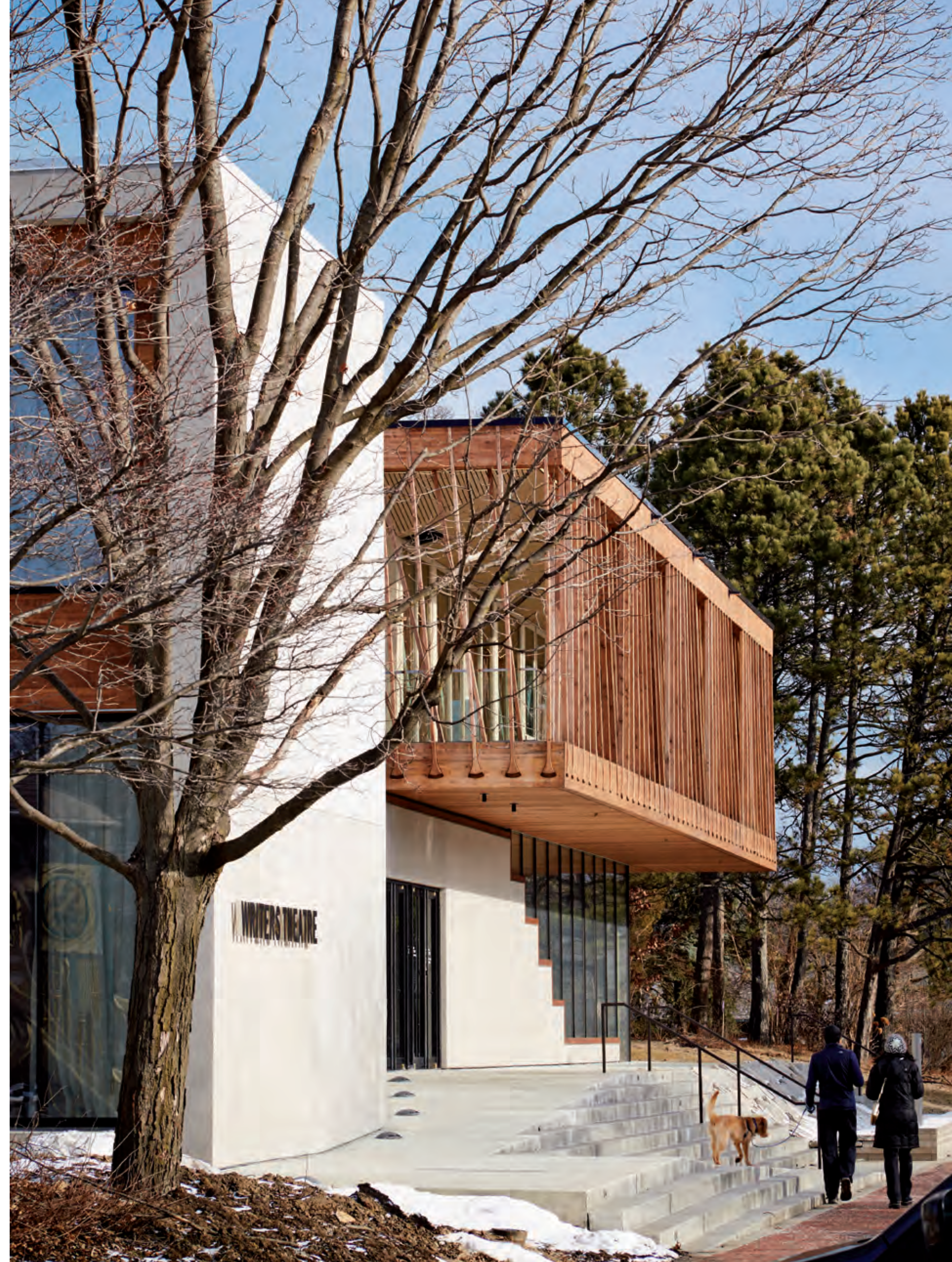
9 (following spread) – The way light shines through the gallery at night has been compared to a lantern