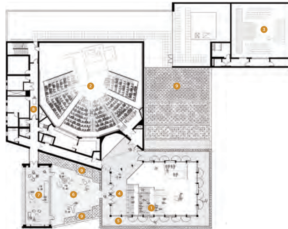
7 (previous spread) – Two tribunes are placed in the lobby, creating a third but less formal performance space