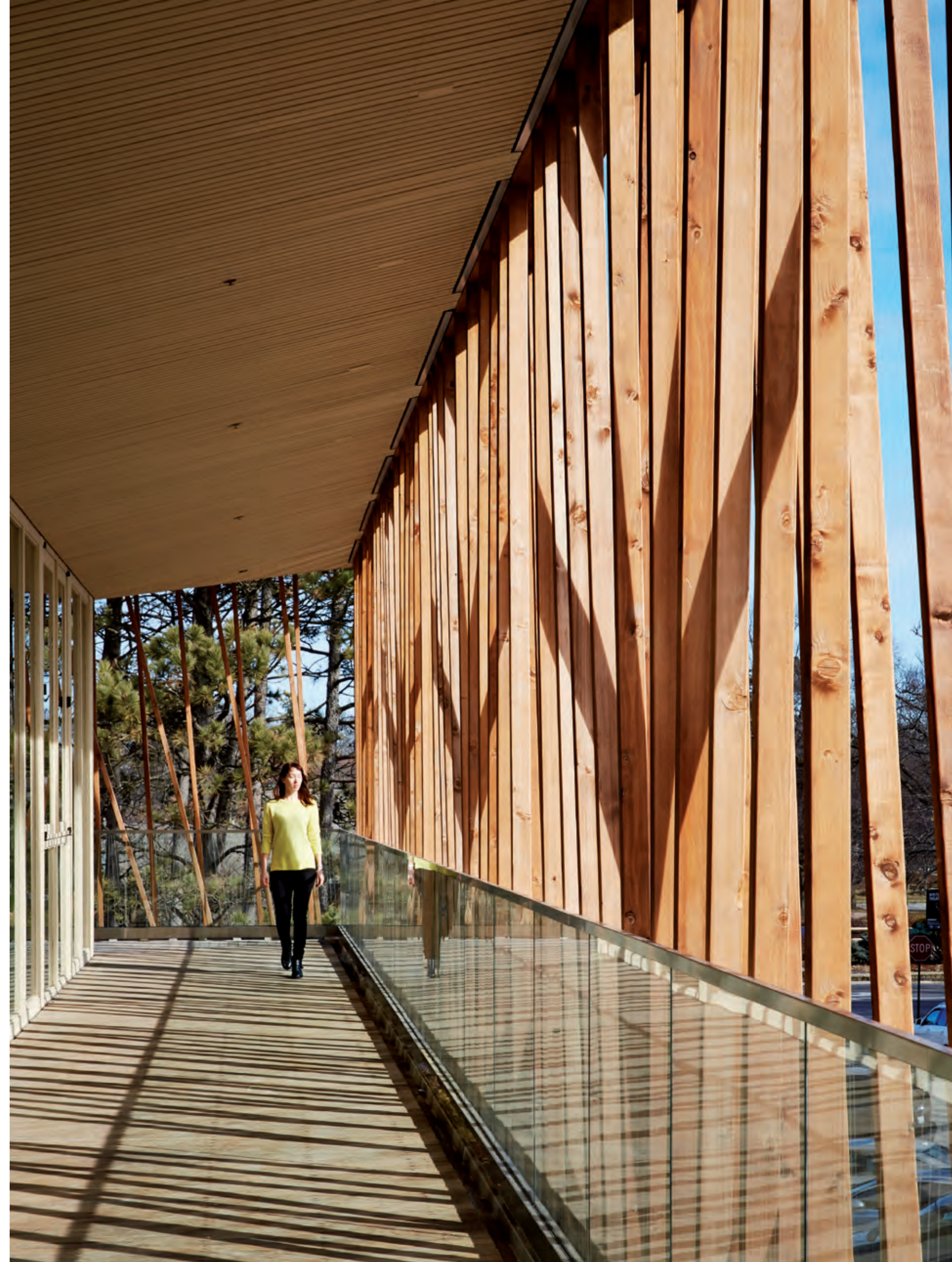
1 & 2