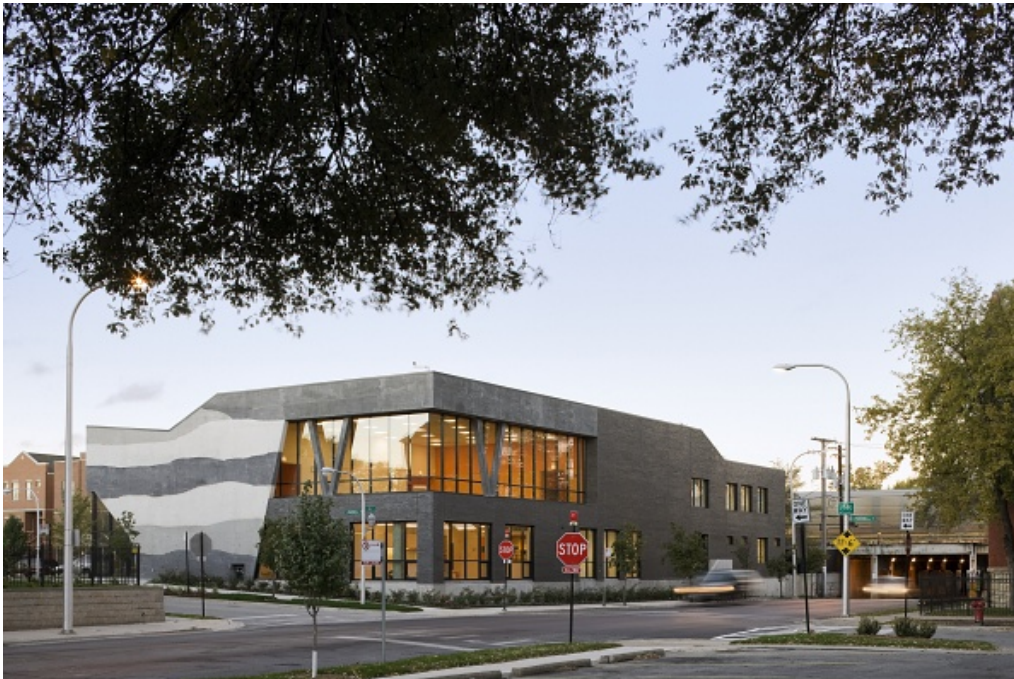
The Community Center serves a growing neighborhood of foster-care families, women, and children in a mix of affordable single family homes and apartment units.